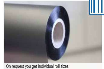
On request you get individual roll sizes.