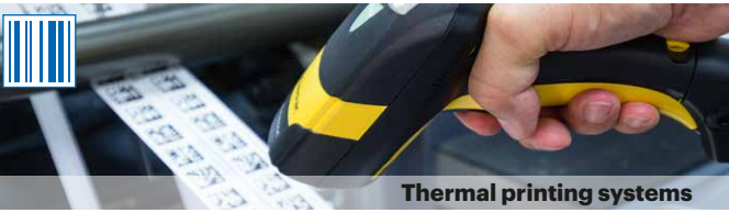
Thermal printing systems