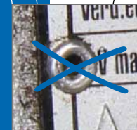
Printed Polyester film - adhered