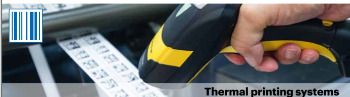
Thermal printing systems