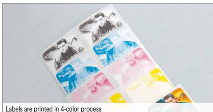
Labels are printed in 4-color process

Colored labels – leaving a permanent impression