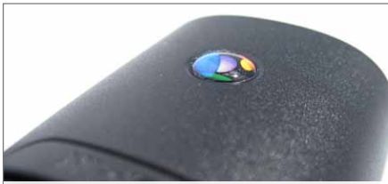
3D Design label on monitor