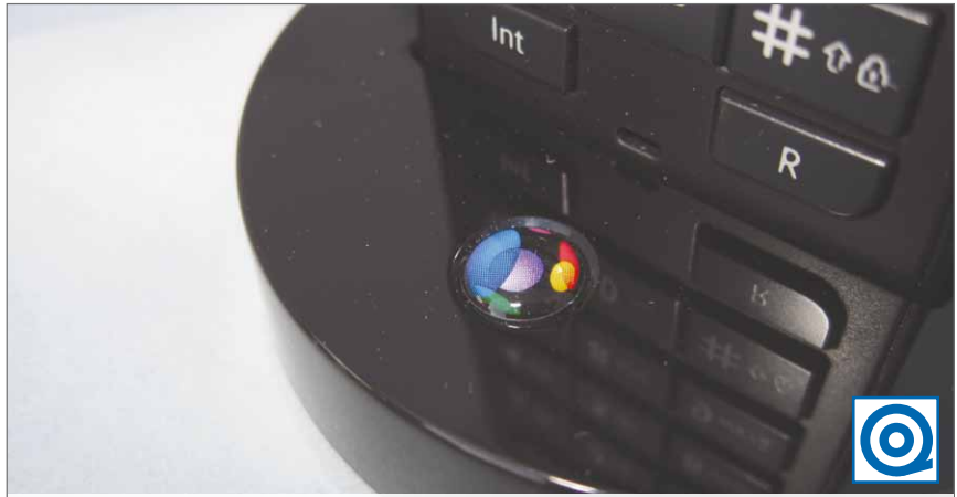
3D-Design-Dome-Label on the charging station