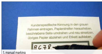
1. manual marking

Because everything is worth something – label your assets