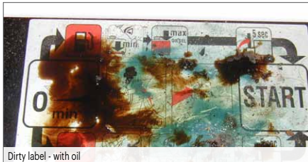
Dirty label - with oil

Meeting highest demands – a clean solution