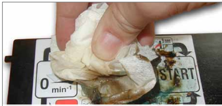
Cleaning with solvent